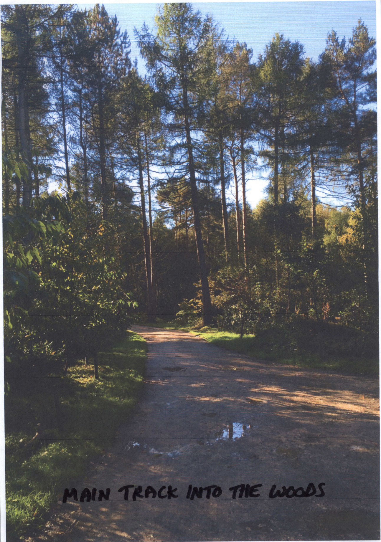
MAIN TRACK INTO THE WOODS