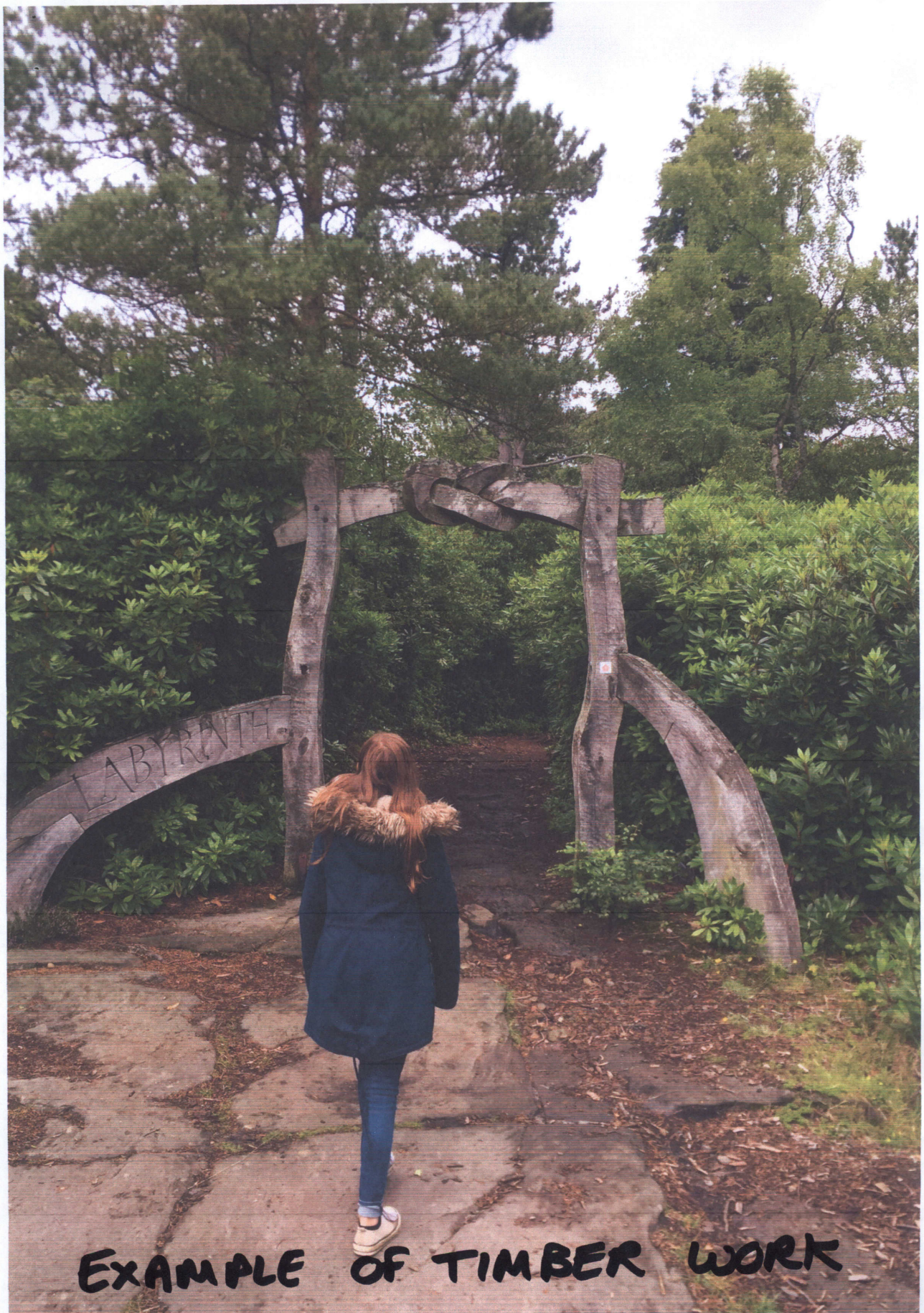
EXAMPLE OF TIMBER WORK