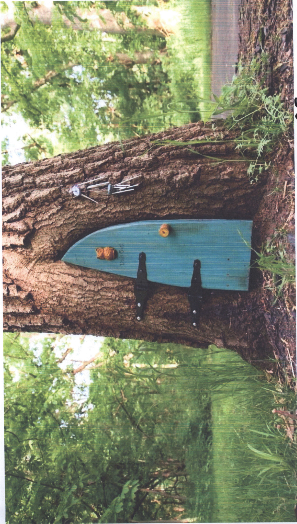
FAIRY DOORS - NOT BRIGHT COLOURS