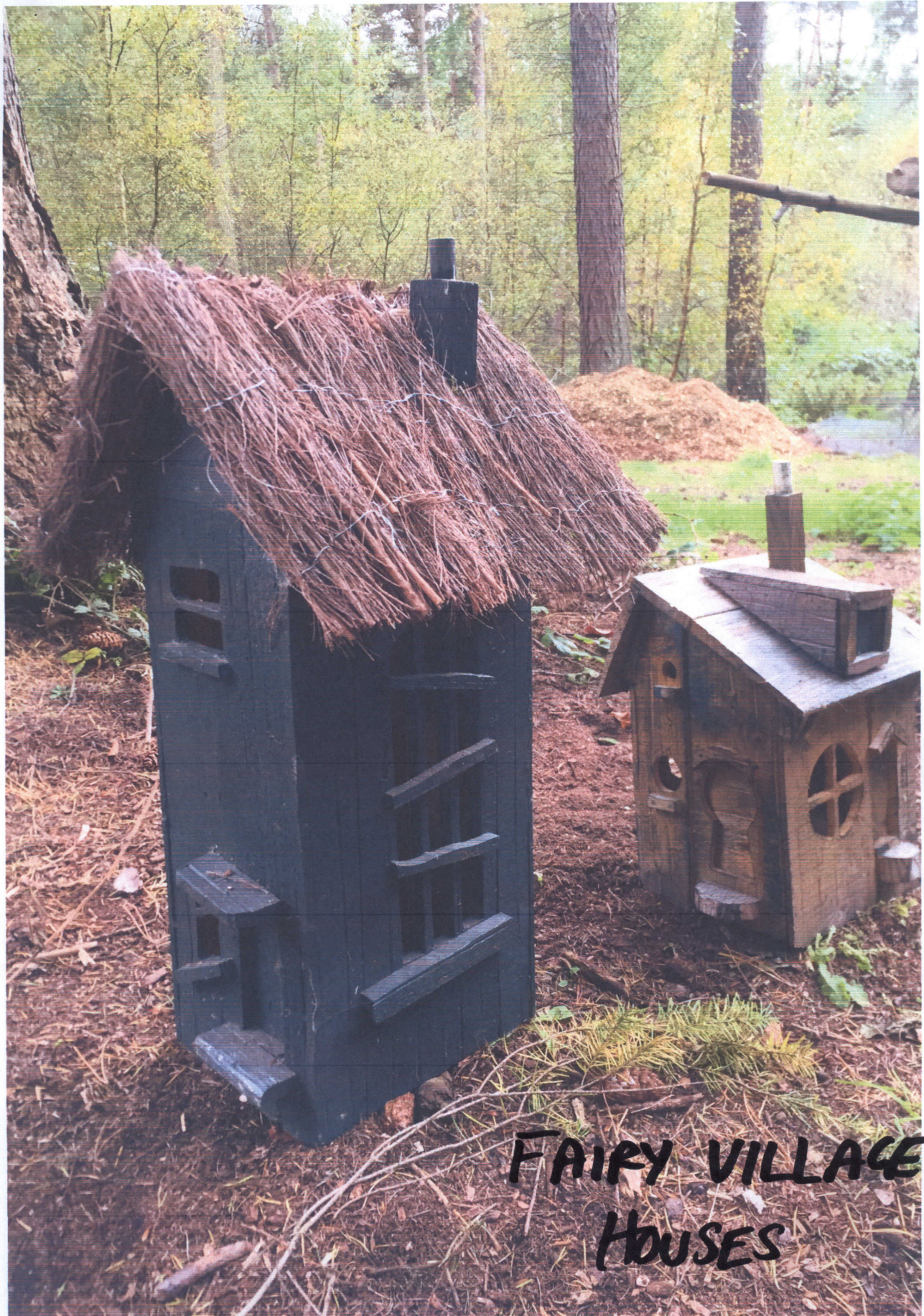
FAIRY VILLAGE HOUSES