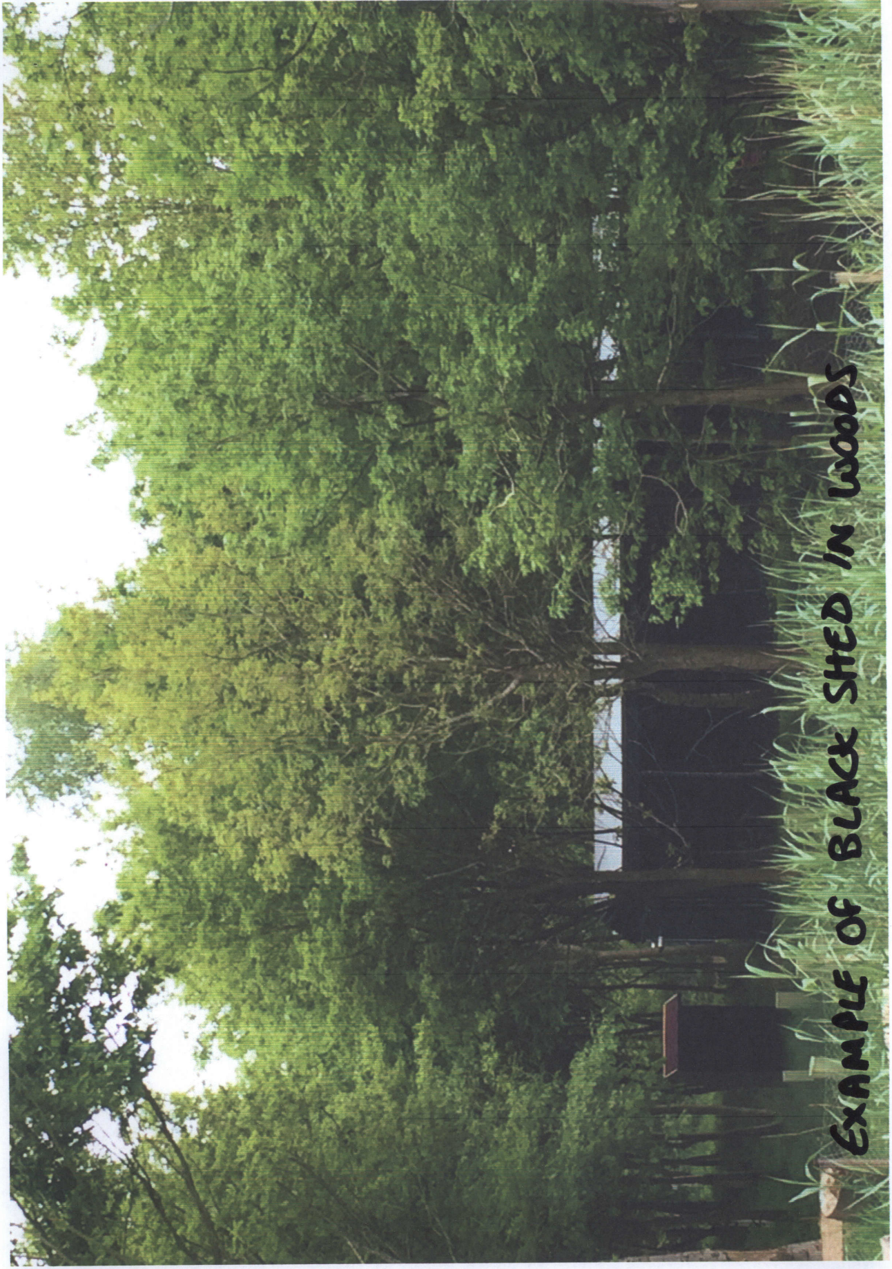
EXAMPLE OF BLACK SHED IN WOODS