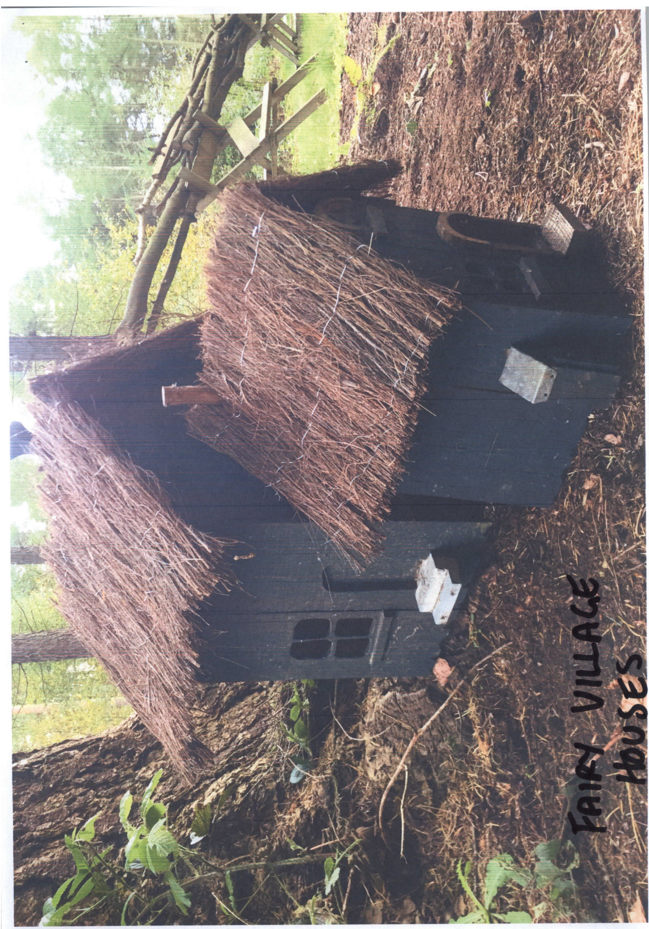
FAIRY VILLAGE HOUSES